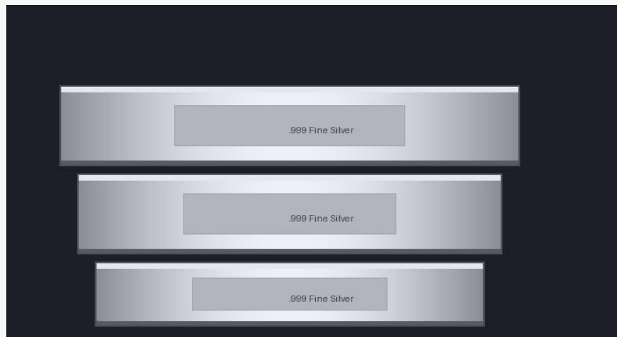
Silver bullion bars — the purest, most direct form of silver investment